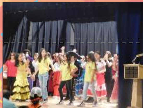
Participants dancing during the last act on stage for the Hispanic Heritage festival before concluding the event.