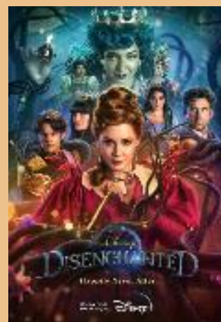
The cover of "Disenchanted" showcases the character Giselle becoming evil.

"Disenchanted" is a sequel of the movie "Enchanted". The original movie is following Giselle on her adventures in a new town. Many years after "Enchanted" came out, Giselle, played by Amy Adams, was living in her perfect world. Then, there was a couple changes and the world was thrown off balance. Giselle changed from sweet to evil, and she wanted to get revenge at her town. The new movie is two hours long and comes out only on Disney+ on November 25th, 2022. The original cast from "Enchanted" is back for a round two.