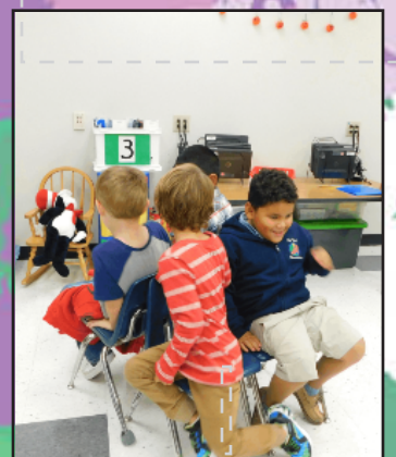
After Care students playing musical chairs with the FFEA members.