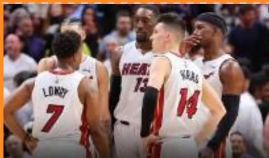
Star players for the Heat huddle up.