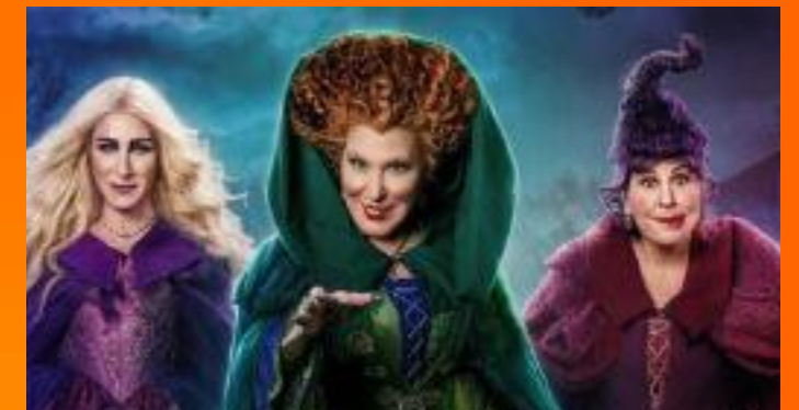
All three of the witches smirking to plan mischief!

When I was watching the movie, It was very dramatic in a funny way and I actually liked how they brought back the old characters and included lots of different elements. It was an emotional roller coaster for me. I was waiting for a while for the movie to come out and I honestly thought everything was on point. I also think that it was interesting to see how the witches would react to being resurrected again. Lots of people are not a big fan, but I think it was worth the wait!