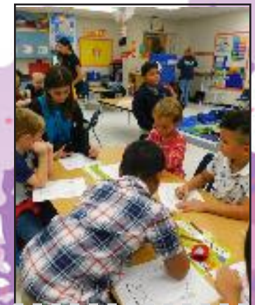
Kindergarten students were coloring as an activity while FFEA members visited.