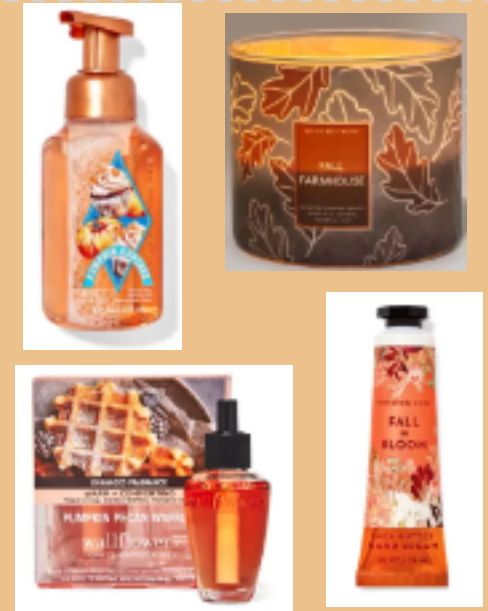
These are some of the fall scents that Bath and Body Works offers. Photo credit Bath and Body Works

Bath and Body Works is an extremely popular brand that sells body care, candles, wallflowers, air fresheners, hand soaps, and hand sanitizers. They come out with a variety of different seasonal scents every year. At this time of year, Bath and Body Works sells fall scents that are perfect for your home and everyday use. These fall scents include Pumpkin Cupcake, Sweet Cinnamon Pumpkin, Pumpkin Pecan Waffles, and many more. Adriana Chenet, 6th grader, loves to get products from Bath and Body Works. She believes that Bath and Body Works fall products are better than fall products from other brands. If she could choose her favorite fall scent, she would choose pumpkin spice. "Pumpkin Spice smells amazing, and others really like this scent," says Adriana.