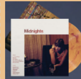
Photo credit Taylor Swift. Midnights has some amazing vinyl covers for the album.