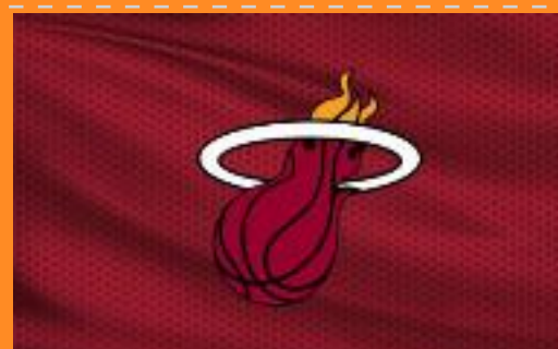
Miami Heat logo, a flaming basketball going through a hoop.